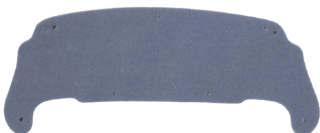
IH 000 100 080 velour sweatband