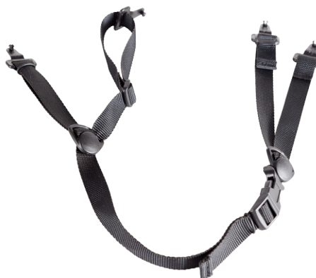
IH 000 001 000 4-point chinstrap with quick release buckle