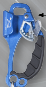
CHEST ASCENDER CD 211L