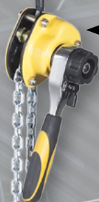
MCH025 HAND CHAIN HOIST